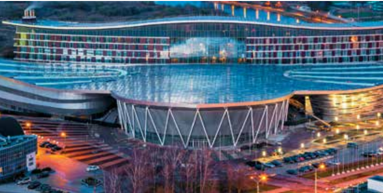
ClassicELOX® CLASSICAL ANODIZING