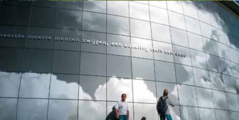
DigitELOX® DIGITAL ANODIZING