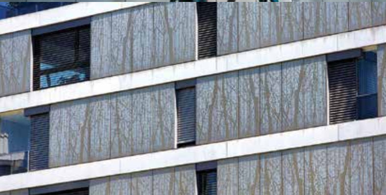
ArtELOX® ARTISTIC ANODIZING