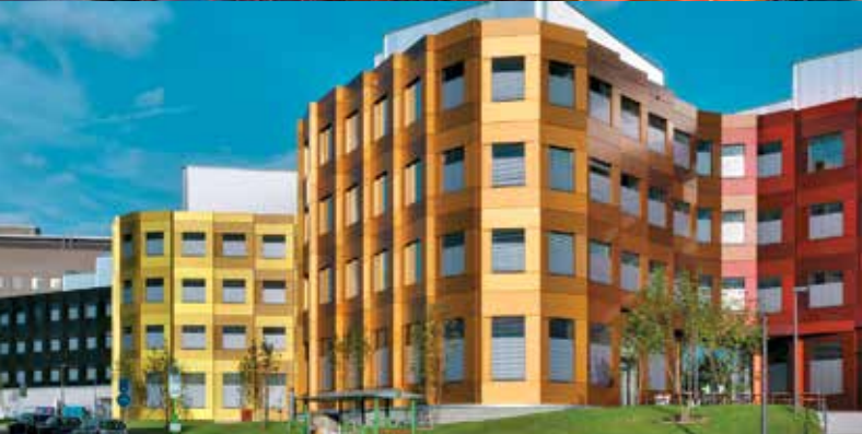
ColorELOX® COLOUR ANODIZING BY SANDALOR TECHNOLOGY